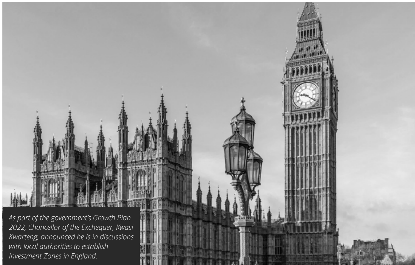
As part of the government's Growth Plan 2022, Chancellor of the Exchequer, Kwasi Kwarteng, announced he is in discussions with local authorities to establish Investment Zones in England.