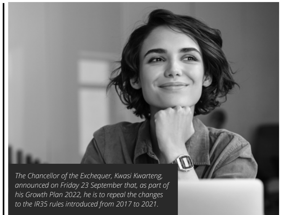
The Chancellor of the Exchequer, Kwasi Kwarteng, announced on Friday 23 September that, as part of his Growth Plan 2022, he is to repeal the changes to the IR35 rules introduced from 2017 to 2021.

Investment Zones will drive growth and unlock housing across the UK through lowering taxes and liberalising planning frameworks to encourage rapid development and business investment. ◀