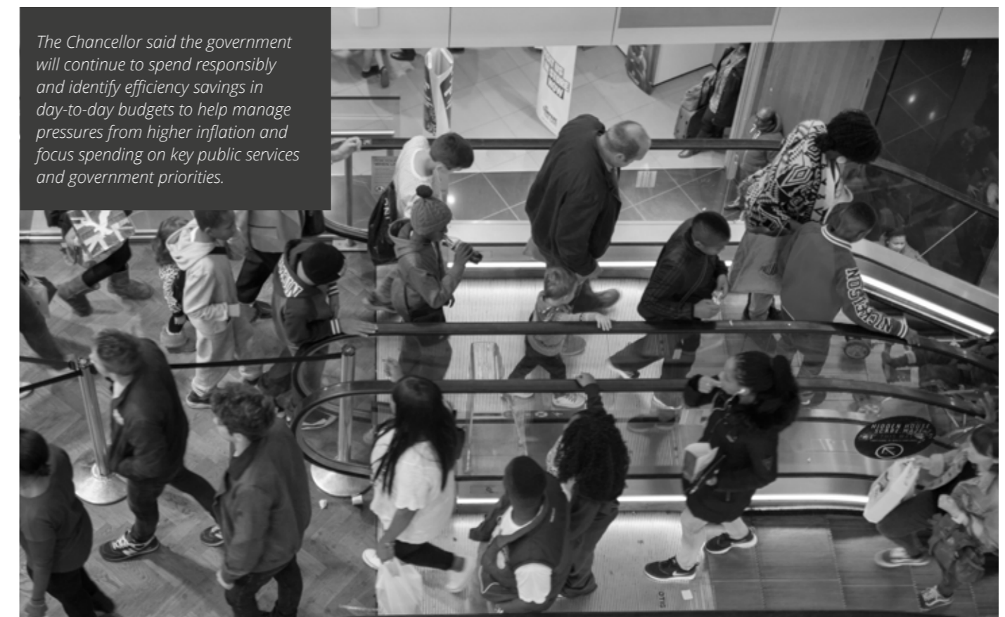
The Chancellor said the government will continue to spend responsibly and identify efficiency savings in day-to-day budgets to help manage pressures from higher inflation and focus spending on key public services and government priorities.

Through these measures, Mr Hunt commented, the Spring Budget builds on the action taken at Autumn Statement 2022 to halve inflation, grow the economy and get debt falling; to support businesses and households with the cost of living; and underpin the UK's long-term prosperity. ◀