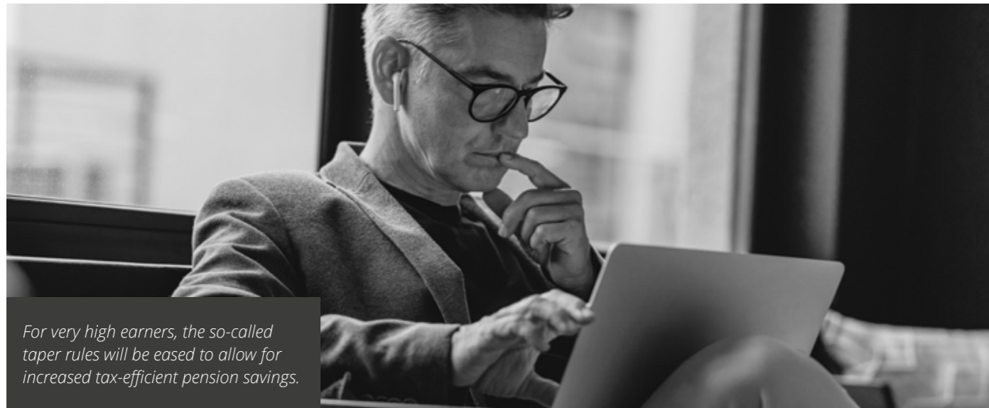
For very high earners, the so-called taper rules will be eased to allow for increased tax-efficient pension savings.