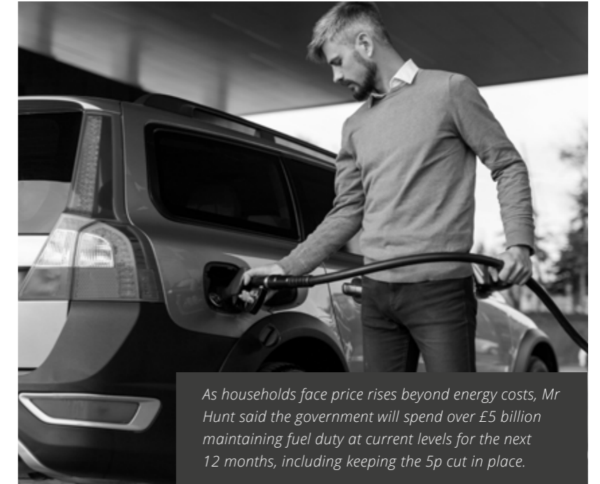
As households face price rises beyond energy costs, Mr Hunt said the government will spend over £5 billion maintaining fuel duty at current levels for the next 12 months, including keeping the 5p cut in place.