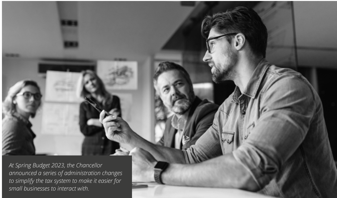
At Spring Budget 2023, the Chancellor announced a series of administration changes to simplify the tax system to make it easier for small businesses to interact with.